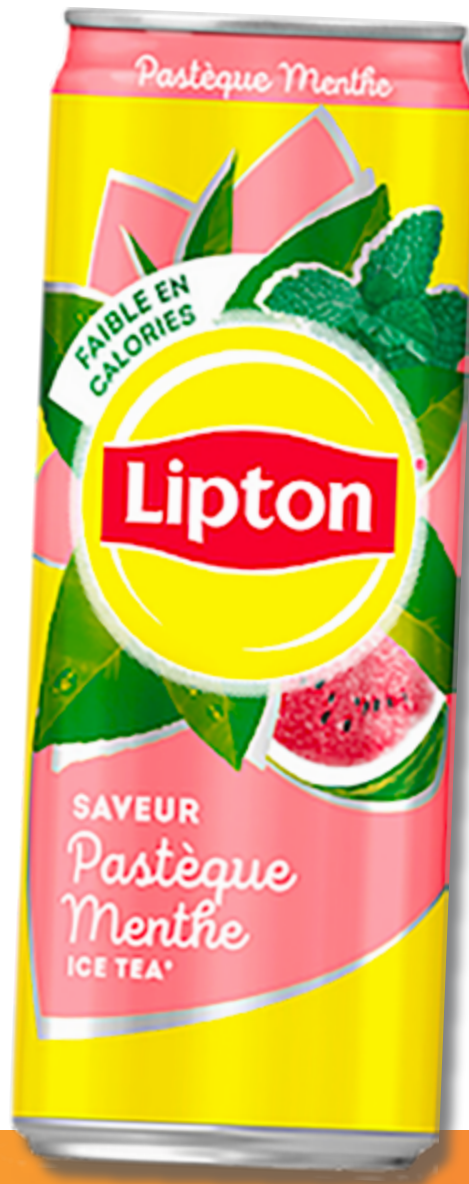
LIPTON MINT-WATERMELON Ref. /33-LPM